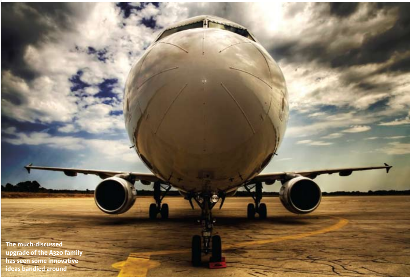
The much-discussed upgrade of the A320 family has seen some innovative ideas banded around

easyJet Pilot Matt Wood takes a look at development options for the A320 family.